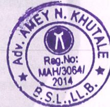
Amey N. Khutale (Advocate)